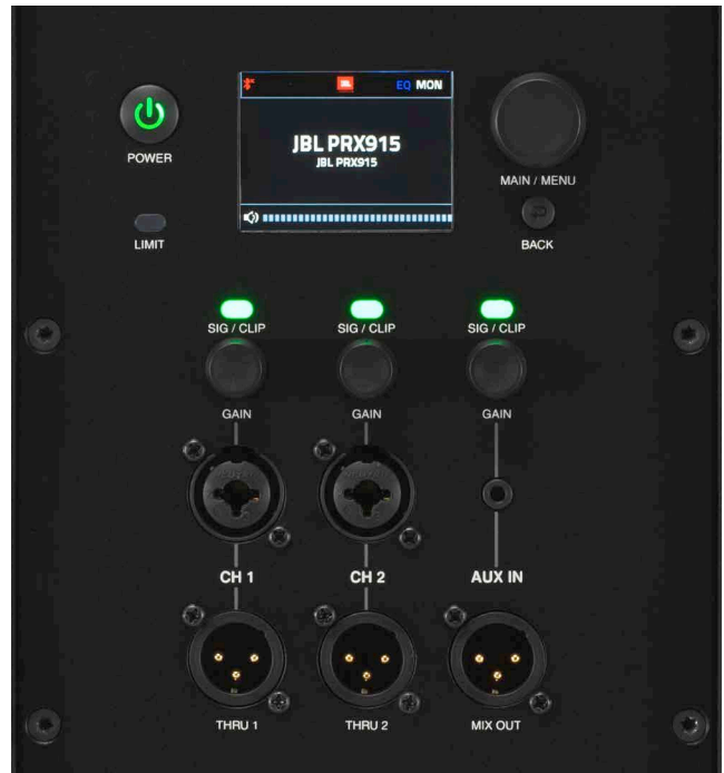
REAR PANEL CONNECTIONS

The JBL PRX915 , part of the PRX900 Series of powered loudspeakers and subwoofers, takes professional portable PA performance to a new level with advanced acoustics, comprehensive DSP, unrivaled power performance and durability, and complete BLE control via the JBL Pro Connect app.