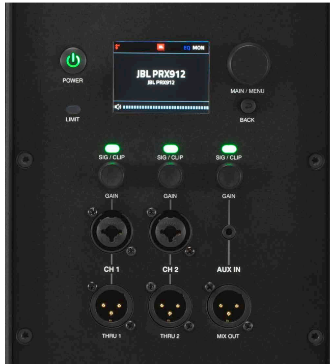
REAR PANEL CONNECTIONS

The JBL PRX912 , part of the PRX900 Series of powered loudspeakers and subwoofers, takes professional portable PA performance to a new level with advanced acoustics, comprehensive DSP, unrivaled power performance and durability, and complete BLE control via the JBL Pro Connect app.