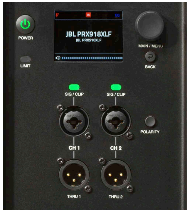
REAR PANEL CONNECTIONS

The JBL PRX918XLF , part of the JBL PRX900 Series powered loudspeakers and subwoofers, takes professional portable PA performance to a new level with advanced acoustics, comprehensive DSP, unrivaled power performance and durability, and complete BLE control via the JBL Pro Connect app.